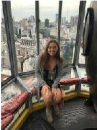
Abby (Argentina) in Buenos Aires until July 8.