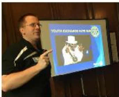
Be the most and host. We all have to be like HYPE Man!!!