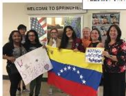
Inbound students taught Rotarians about the Culture Shock Wave that students experience during their year.